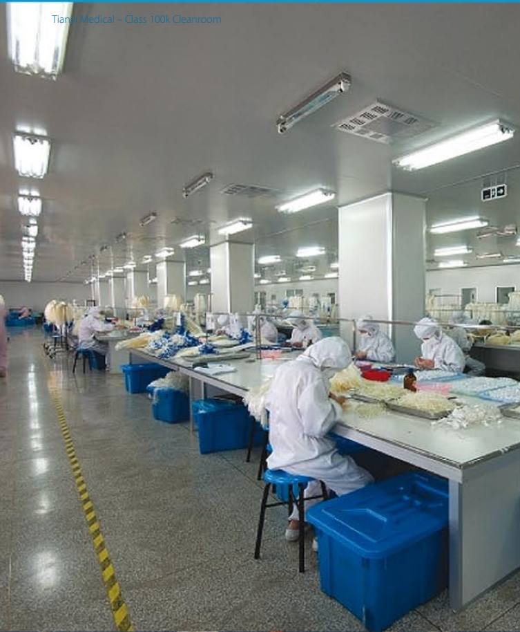
Tianyi Medical - Class 100k Cleanroom